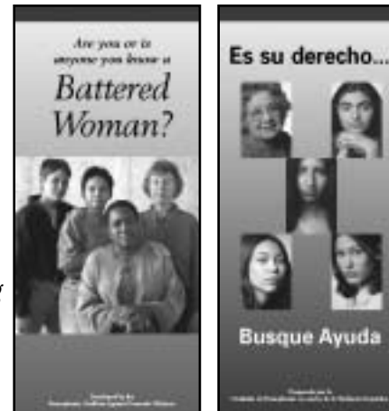
(English and Spanish)

This five panel, bilingual brochure provides a general overview of domestic violence and services provided by local domestic violence programs. It includes information about obtaining a Protection From Abuse (PFA) order and a listing of hotline numbers for local domestic violence programs within the state. (English on one side, Spanish on the reverse)